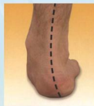
矯正前 Without Orthotics

無論兒童或成年人，因內足弓下陷而引起的足患，皆可透過穿著合適的矯正鞋墊，令情況得以改善。 It is highly recommended that either children or adult could wear the appropriate orthotic insole to improve the foot problems caused by collapsed foot arch.