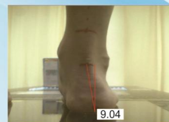
足部後跟斜度量度 Rearfoot angle measurement 9.04

其他檢查如：步態分析、長短腳量度、前掌外內翻量度、脛骨外內旋量度、拇趾外翻量度、膝部形態等。 Other examinations include: Gait analysis, leg length measurement, forefoot evaluation, tibial torsion, hallux valgus and knee angle measurement etc.