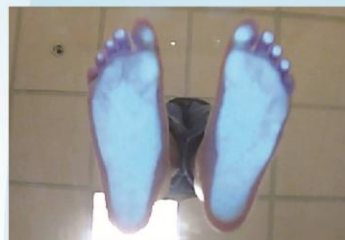
足底形態分析 Foot prints analysis